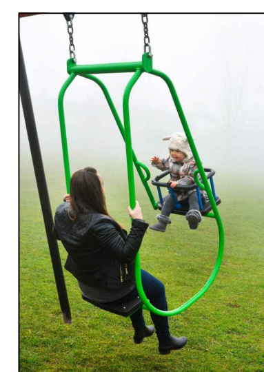
Memory Toddler & Adult Swing, Wicksteed