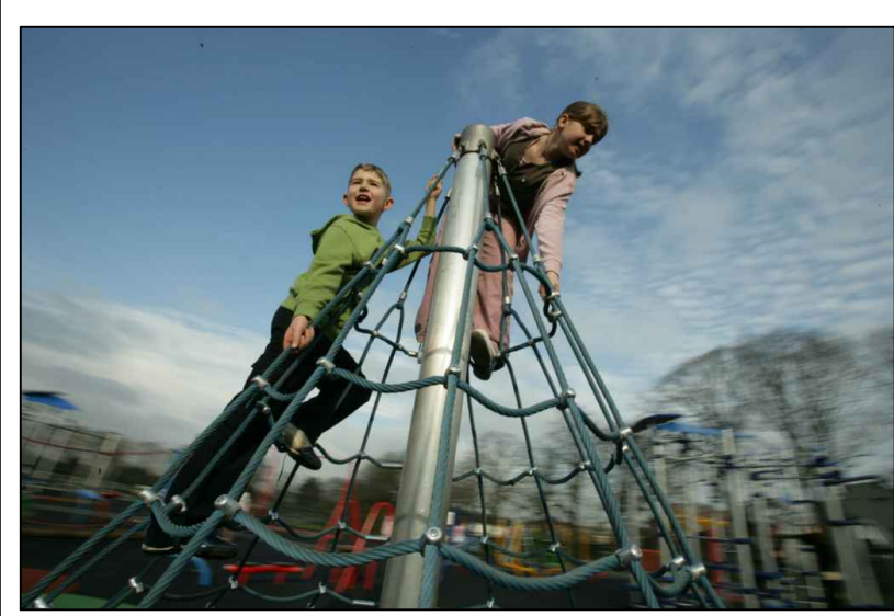
Rota Web climbing net, Wicksteed