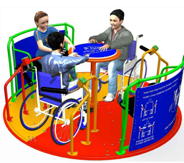
GL Jones Ability Whirl