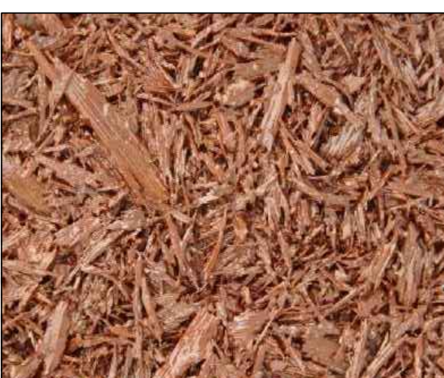
Rubber mulch safety surfacing, Soft Surfaces

Rocking shuttle on safety tiles - equipment to be removed. Foundations, associated safety surfacing and arisings to be removed from site. Area to receive new topsoil to finished level and grass seed.